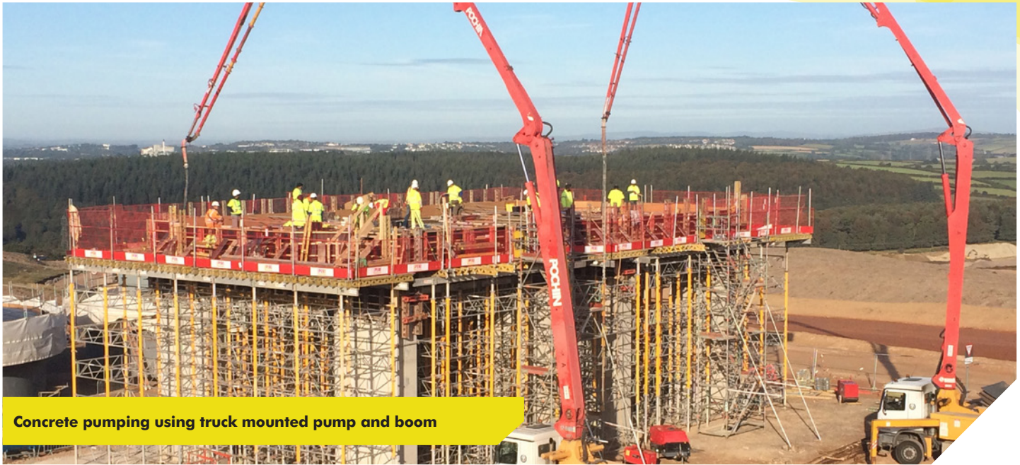
Concrete pumping using truck mounted pump and boom

Then in line with the structural engineer's drawings the Steelfixer places in the steel reinforcement bars, and ties them in place using wire. The tied steel is called a reinforcement cage, because it is shaped like one.