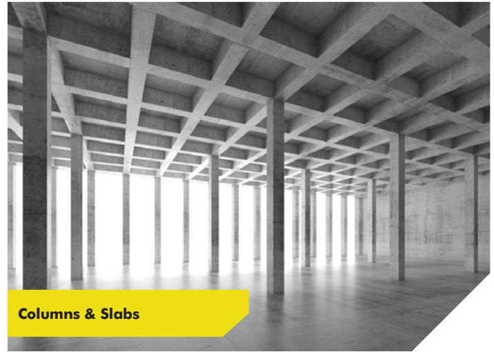
Columns & Slabs

prepare the ground and foundations required for the building; these operations involve the use of construction plant and equipment.