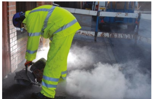
Figure 1 Common tasks like cutting can create very high dust levels

However, most of these diseases take a long time to develop. Dust can build up in the lungs and harm them gradually over time. The effects are often not immediately obvious. Unfortunately, by the time it is noticed the total damage done may already be serious and life changing. It may mean permanent disability and early death.