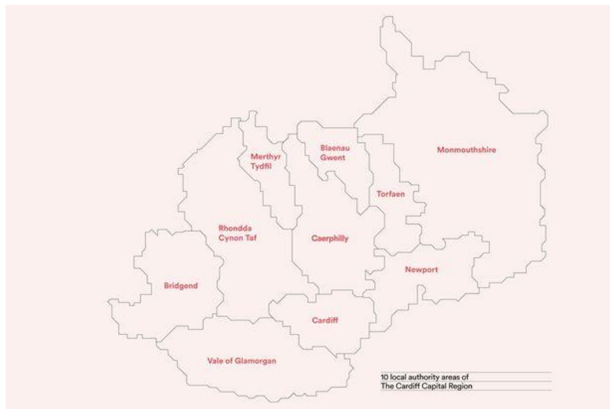
Figure 2: The Cardiff City Region 33

The Cardiff 32 City Region for the purposes of the Cardiff City Deal is made up of ten local authorities. They are Cardiff, the Vale of Glamorgan, Blaenau Gwent, Caerphilly, Monmouthshire, Newport, Torfaen, Bridgend, Merthyr Tydfil and Rhondda Cynon Taf. This Gwent framework has been put together based on the National Probation Service's regions of Wales and all the regions in the Gwent area are set to benefit from the Cardiff City Deal.